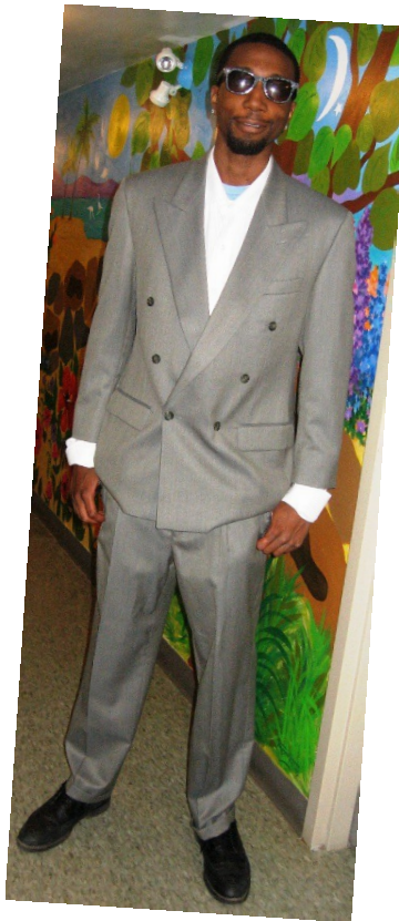
YWS youth prepares for a job interview